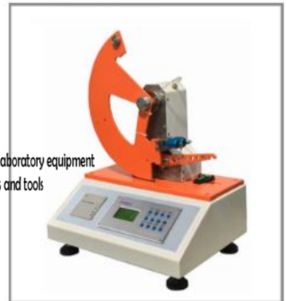
Digital Paper Tear