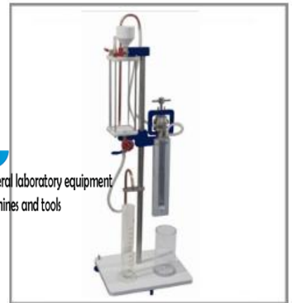
Schopper air perme