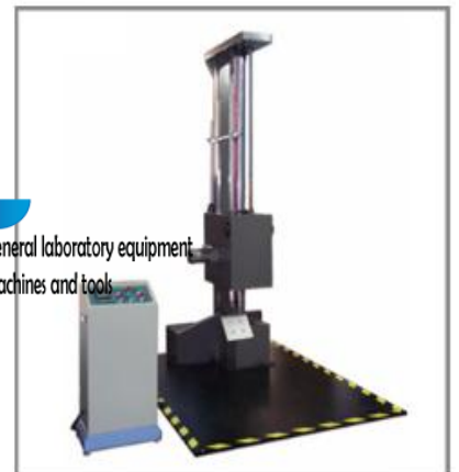
Single-Wing Drop T