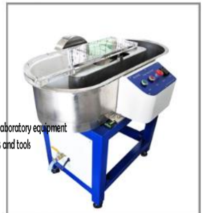
Pulp Valley Beater