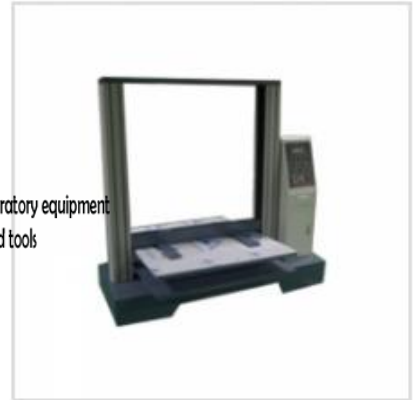
Box Compression Tester(Computer Model) GT-N02B