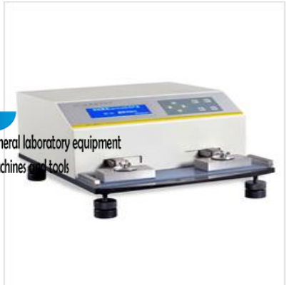
intelligent Ink Rubbing Fastness Tester OT-S001