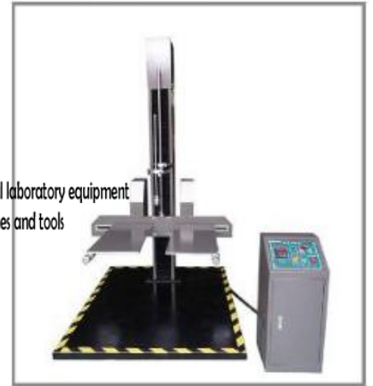
Packaging Double-Wing Drop T