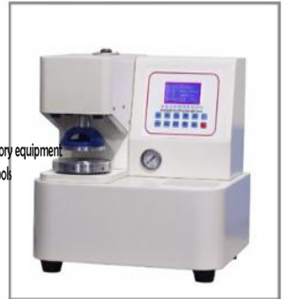
Automatic Mullen B