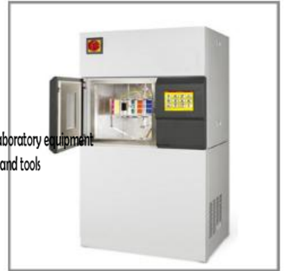
Xenon Light Colorf