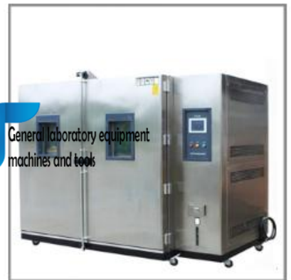
Walk-in test chamb