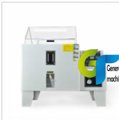
Environmental Corrosion Chamber Salt Spray Tester GT-F50A