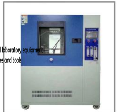
Water Rain Spray&n