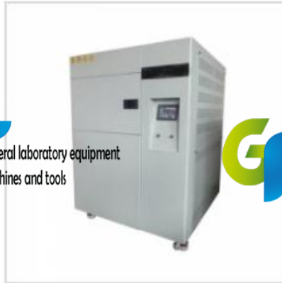
Thermal Shock Chamber GT-F56

General laboratory equipment machines and tools