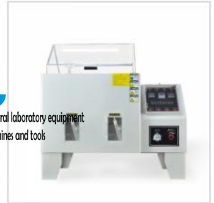
PLC Touch Screen Salt Spray Corrosion Test Chamber GT-F50B

General laboratory equipment machines and tools