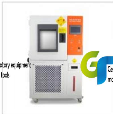
Temperature and Humidity Climatic Test Chamber GT-C52

General laboratory equipment machines and tools