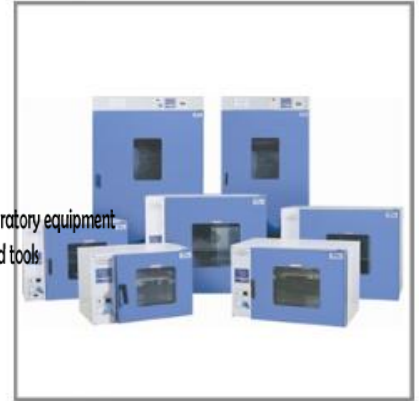
Precision High Tem