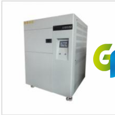
Thermal Shock Chamber GT-F56