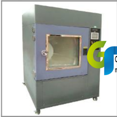
Sand Dust test&nbs