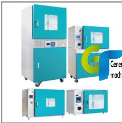
Vacuum Drying Oven

General laboratory equipment machines and tools