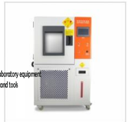
Environmental Chamber Temperature and Humidity Test

General laboratory equipment machines and tools