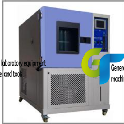
Ozone Aging Test&n